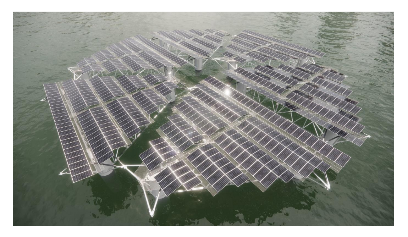
Caption: Close-up of floating solar power plant